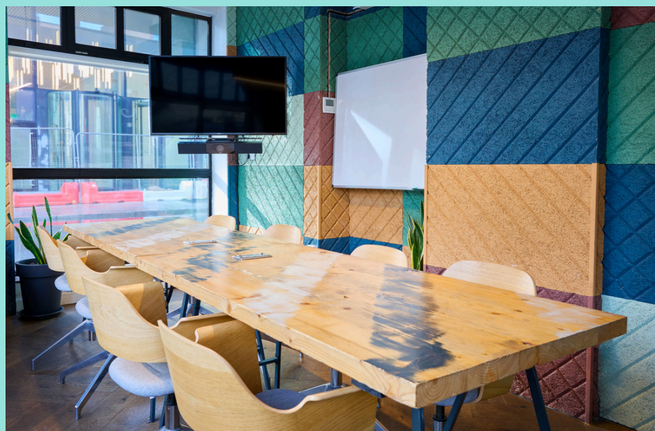
Access to two meeting rooms with 6 hours of free credit monthly