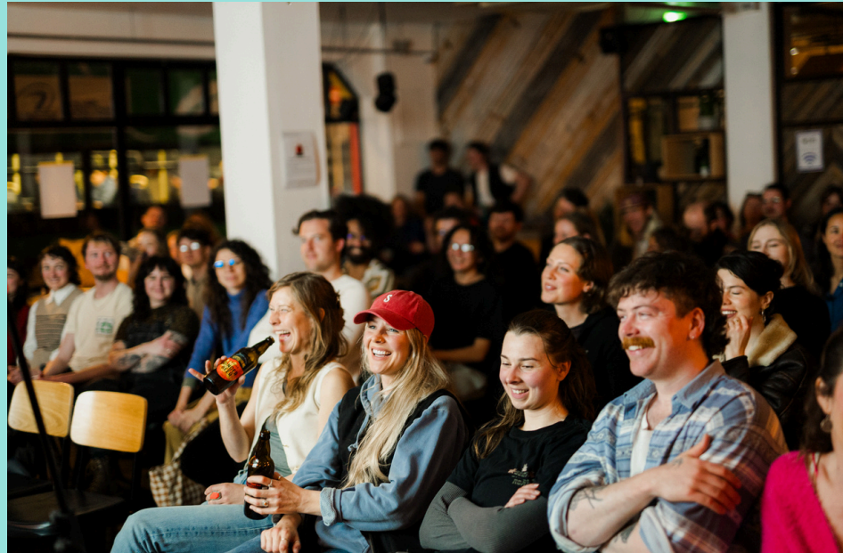
Vibrant monthly event programme