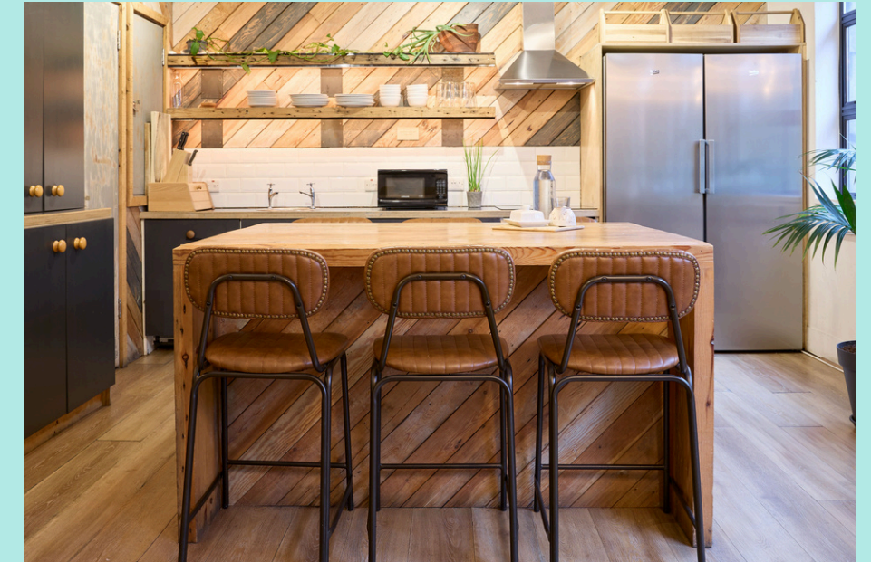
Access to two kitchens