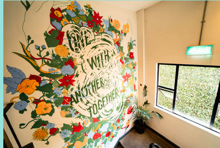
24/7 building access