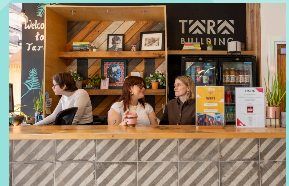
Reception to meet & greet your clients