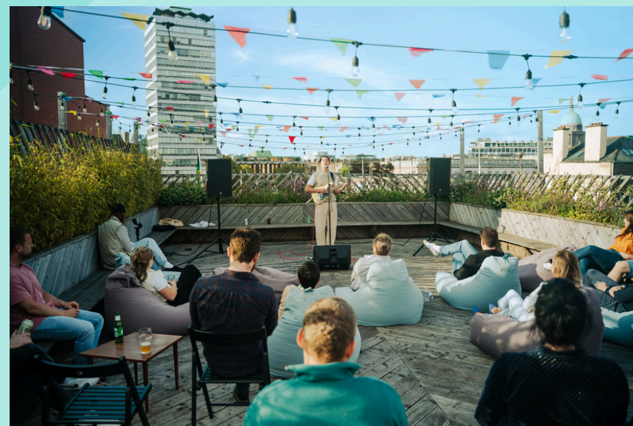
Access to our beautiful rooftop garden