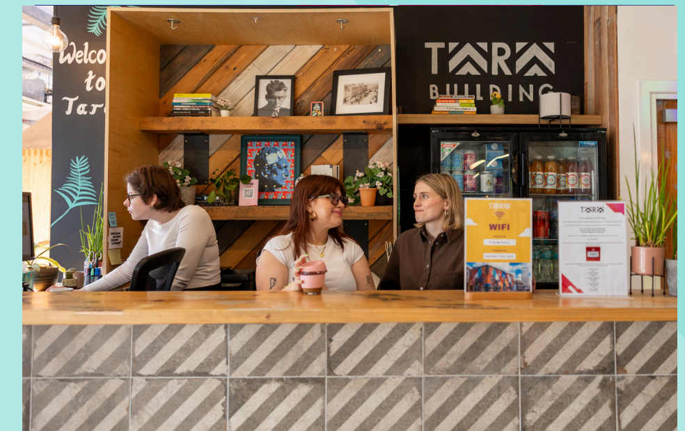
Reception to meet & greet your clients