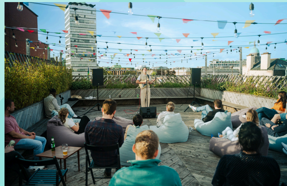
Access to our beautiful rooftop garden