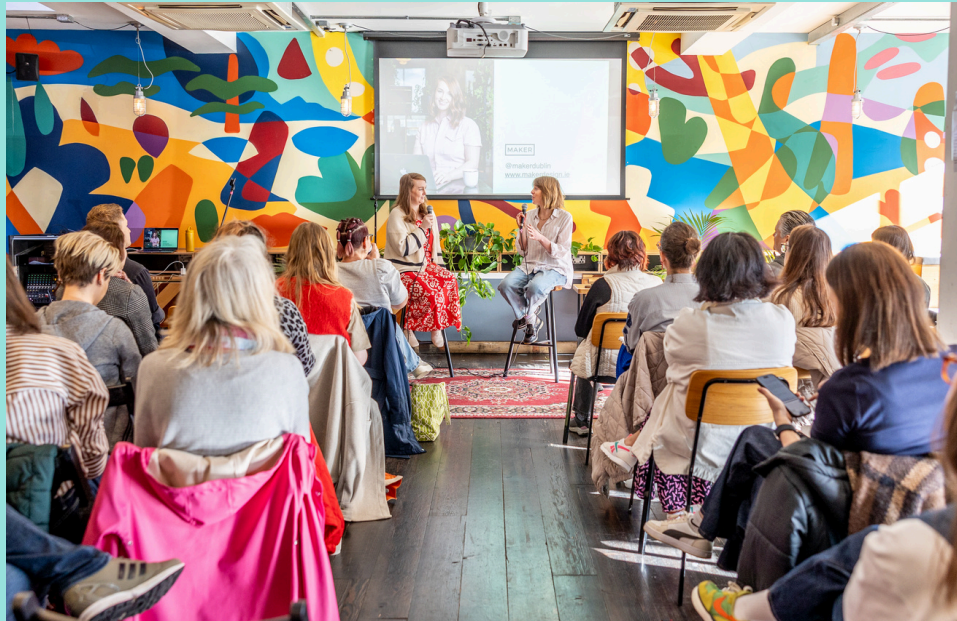
Vibrant monthly event programme