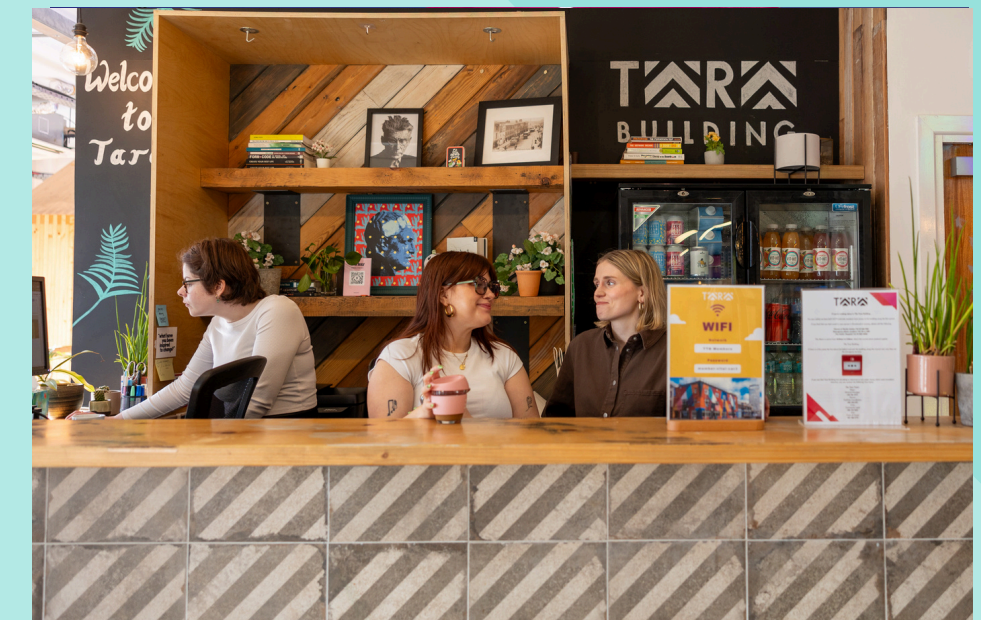
Reception to meet & greet your clients