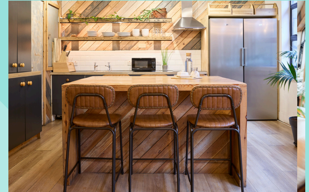
Access to two kitchens