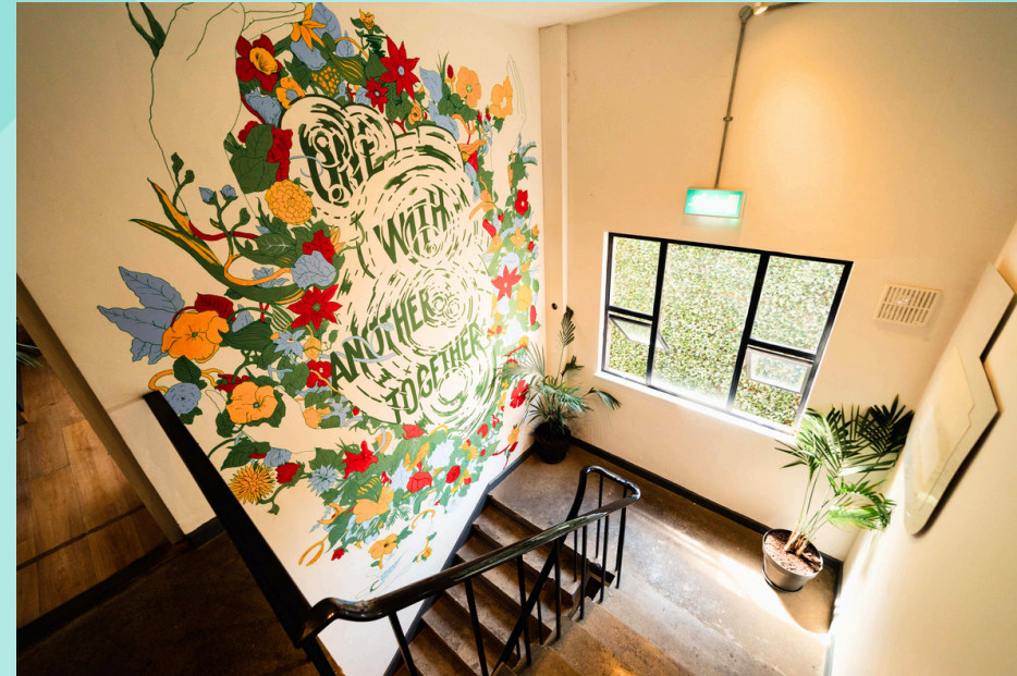
24/7 building access